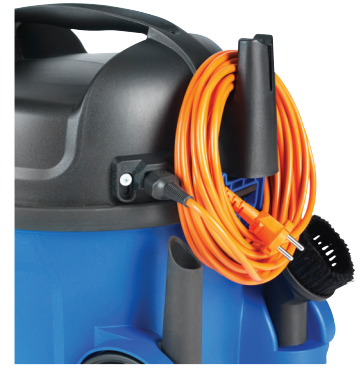
Detachable orange cord and cord hook for controlled storage