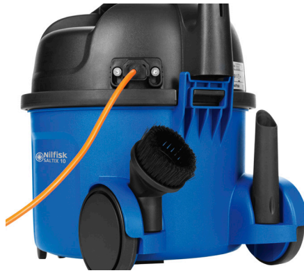
Storage for nozzles allow all the tools you need to be within easy reach at all times