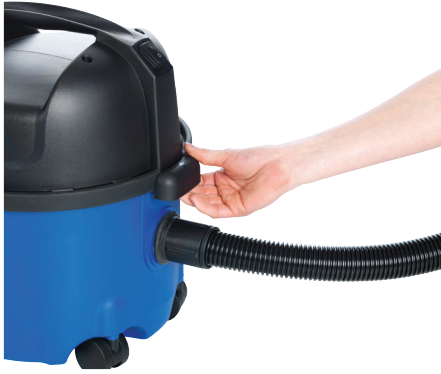
The robust latch system makes it easy to open for changing the dust bag